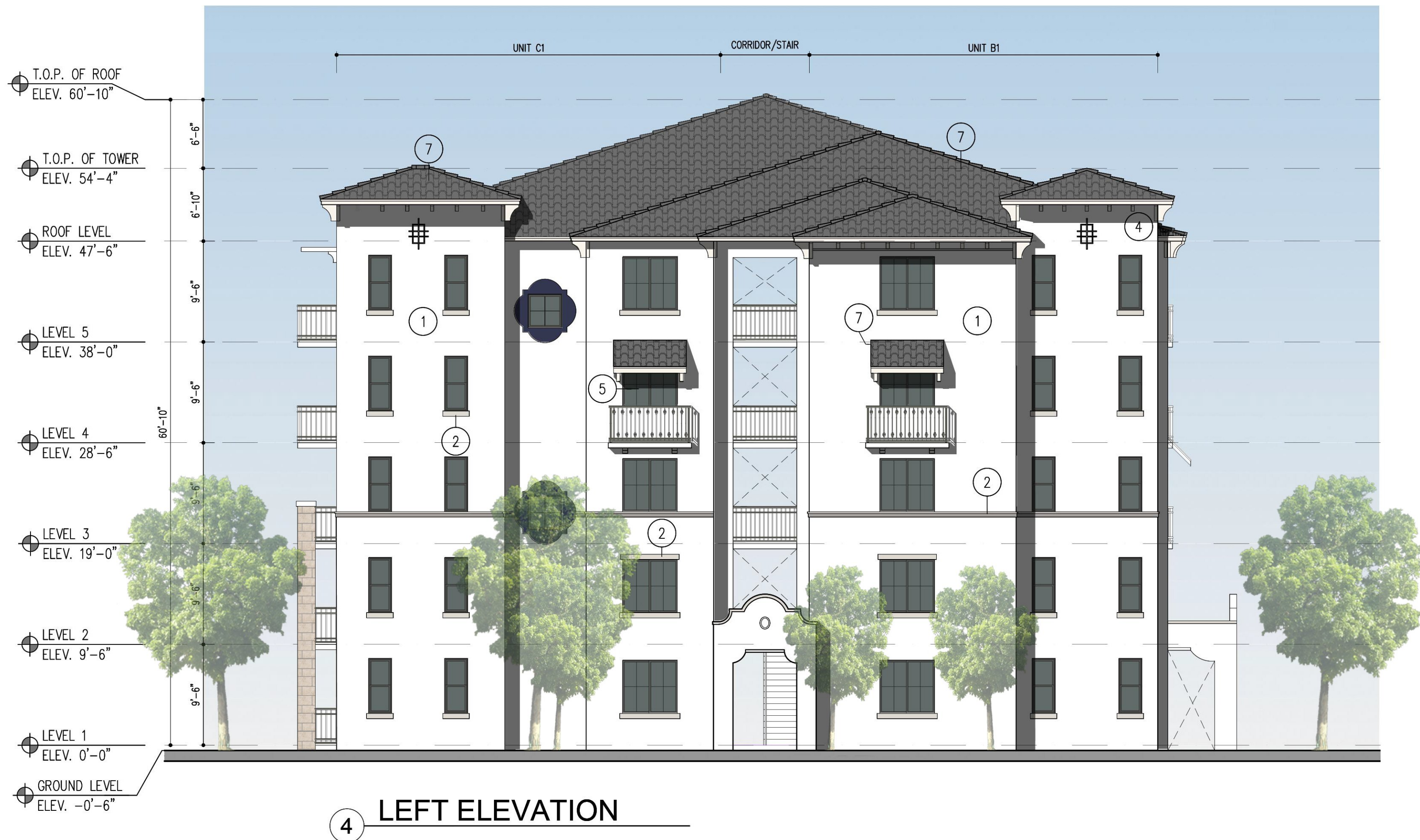
4 LEFT ELEVATION