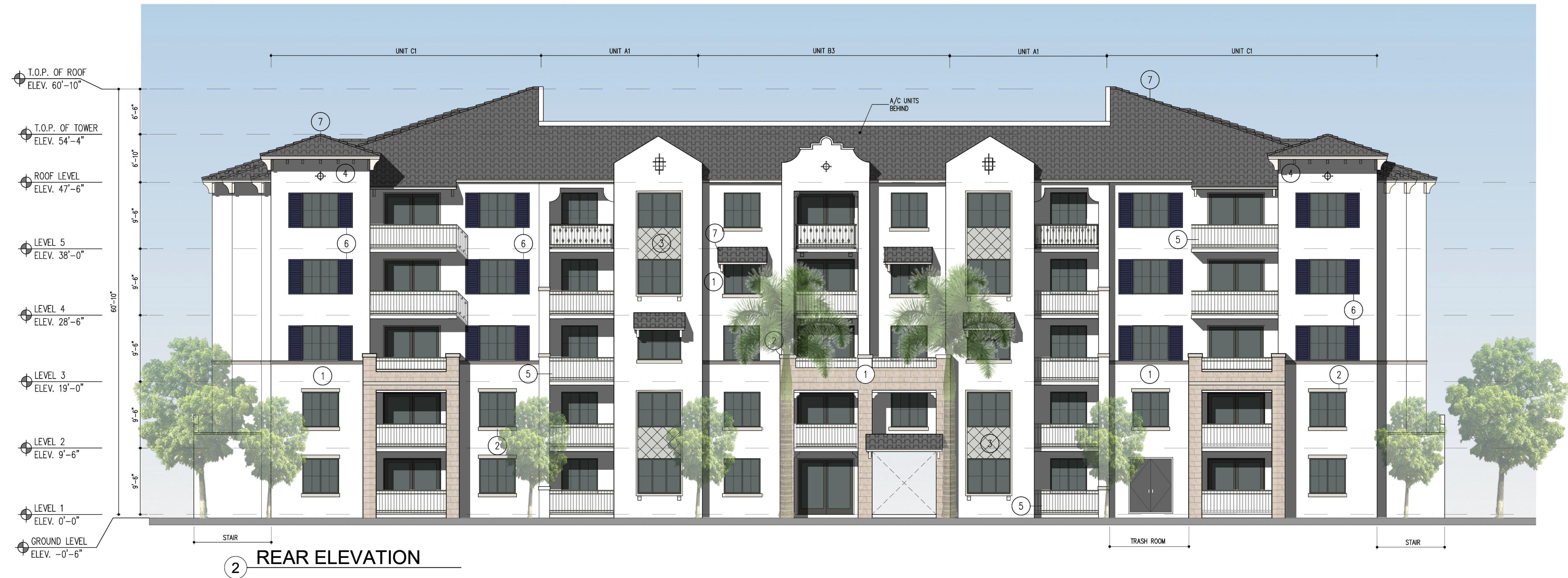
2 REAR ELEVATION